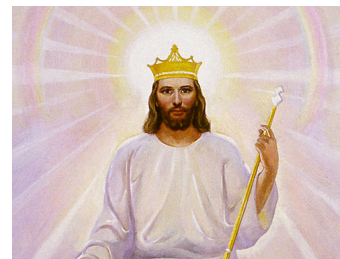
King of Kings

"In those days shall Judah be saved, and Jerusalem shall dwell safely: and this is