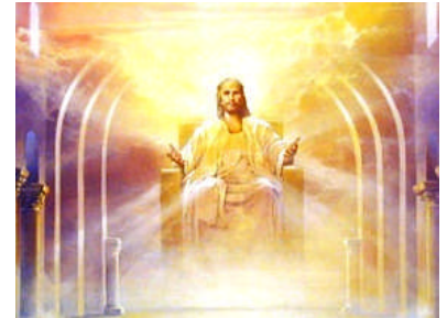
Christ on David's Throne

Furthermore, in Matt 19:28 Jesus promised the disciples that in His kingdom they would sit on 12 thrones judging the 12 tribes of Israel. Acts 1:3 tells that Jesus taught his disciples for 40 days about the kingdom. Apparently He had been teaching about the future restored kingdom for Israel and they wanted to know when it would occur. In Acts 1:6-7 He told them not to be concerned about the timing. IF they were mistaken in understanding about the restored kingdom would it not be logical to conclude he would have corrected them at that point?