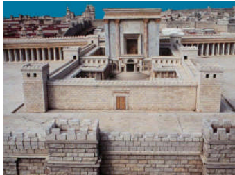
Model of Herod's Temple

"Christ will return at the battle of Armageddon and defeat the armies of the world, the Antichrist and all those that oppose Israel, Christ and God."