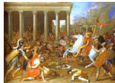
Destruction of the Temple in 70 A.D.

The people that destroyed the Jewish temple and the city was the Roman