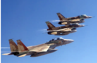
Squadron of Israeli F16s

and carried me out in the spirit of the LORD, and set me down in the midst of the valley which was full of bones, And caused me to pass by them round about: and, behold, there were very many in the open valley; and, lo, they were very dry. And he said unto me, Son of man, can these bones live? And I answered, O Lord GOD, thou knowest. Again he said unto me, Prophesy upon these bones, and say unto them, O ye dry bones, hear the word of the LORD. Thus saith the Lord GOD unto these bones; Behold, I will cause breath to enter into you, and ye shall live." - Ezekiel 37:1-5