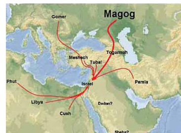
The Gog/Magog Invasion of Israel