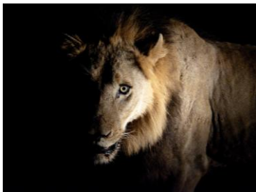
..walks about like a roaring lion, seeking whom he may devour.

How many of us fathers wouldn't get protective to a point of physical confrontation if some strange man