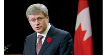
Canadian PM Stephen Harper

"And I will bless them that bless thee, and curse him that curseth thee:" – Genesis 12:3