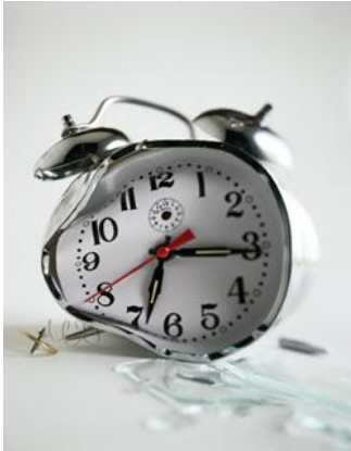
Correct twice a day

puzzled me, for I always wondered why you never see the headline in the morning paper "Psychic wins lottery?"