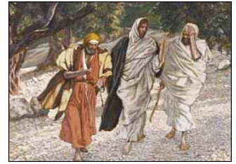
Three men on the Emmaus Road

“One of the most amazing events of prophecy occurred many years ago in the birth, life, death and resurrection of the one called ‘Christ’.”