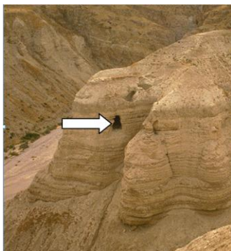
Cave at Qumran

In 1947 a shepherd boy, tending his father's sheep in Qumran (to the north and west of the dead sea), made an amazing discovery while looking for a lost sheep.