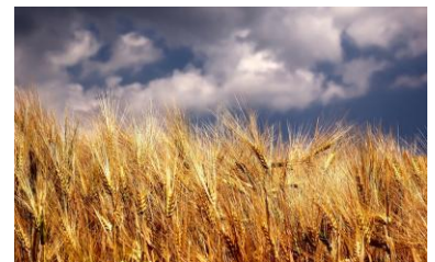
The Harvest Fields

"The 2nd coming is mentioned in every book but three of the New Testament."