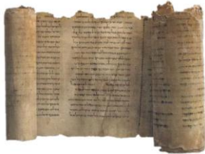
The scrolls of Isaiah (Dead Sea Scrolls)

Essenes, a Jewish sect living in Qumran, 2000 years ago.