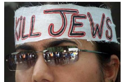
The Agenda of Israel's Neighbors

“We call them the Palestinians, in spite of the fact that up until 1948 no such ethnic label ever existed.”